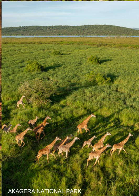
AKAGERA NATIONAL PARK