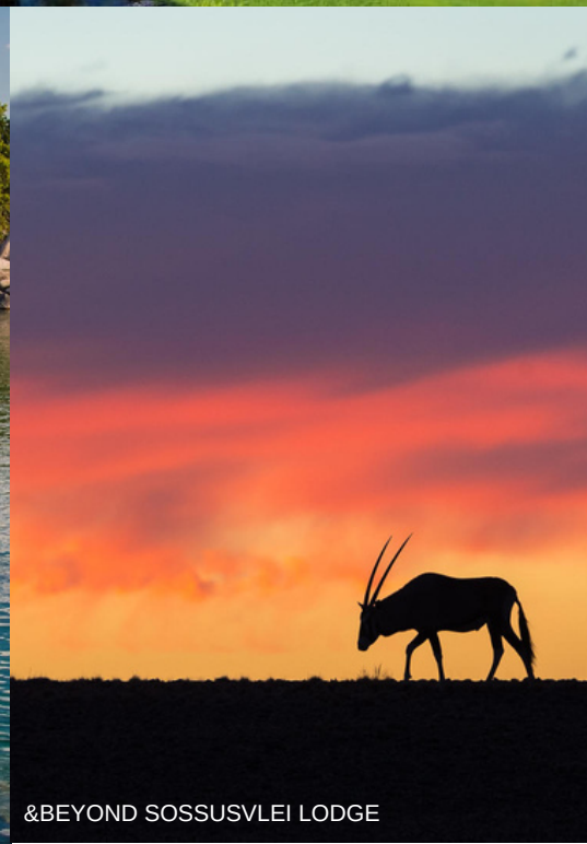
&BEYOND SOSSUSVLEI LODGE