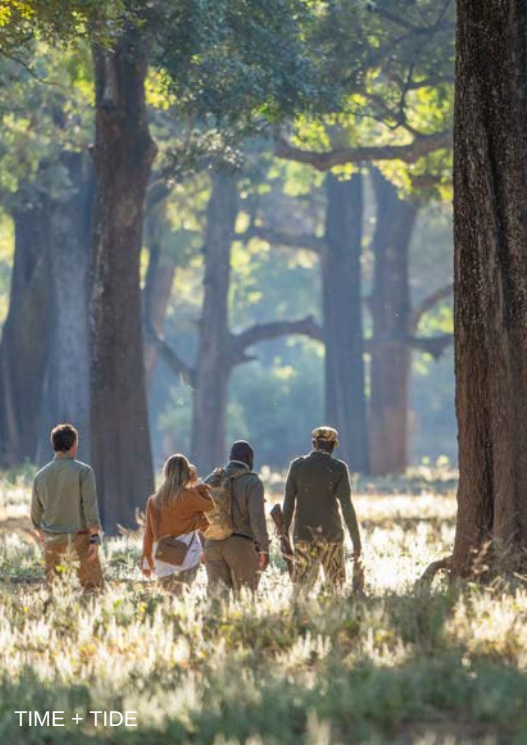
TIME + TIDE