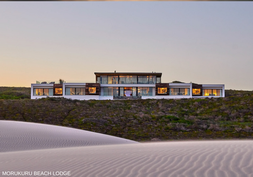
MORUKURU BEACH LODGE