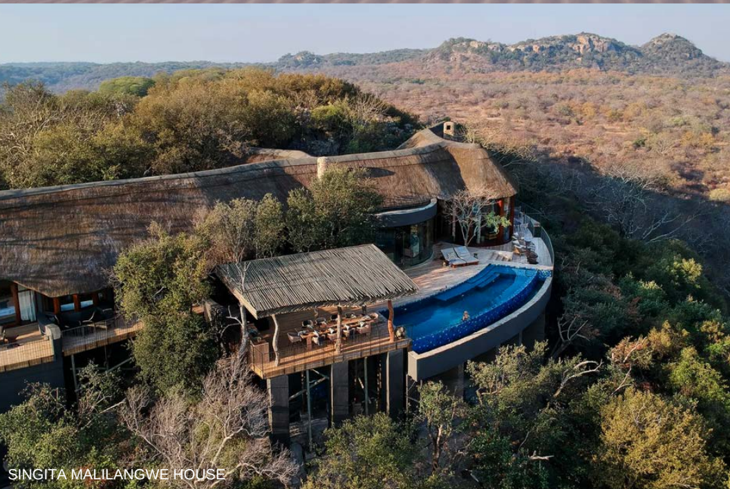
SINGITA MALILANGWE HOUSE