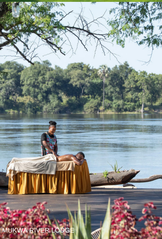
MUKWA RIVER LODGE